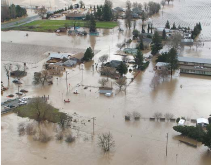
Hopland Elementary, center right. January 5, 2006